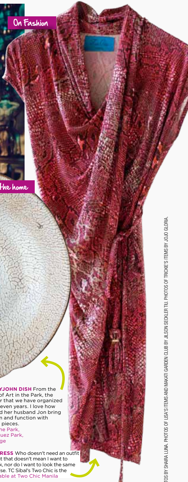
For the home