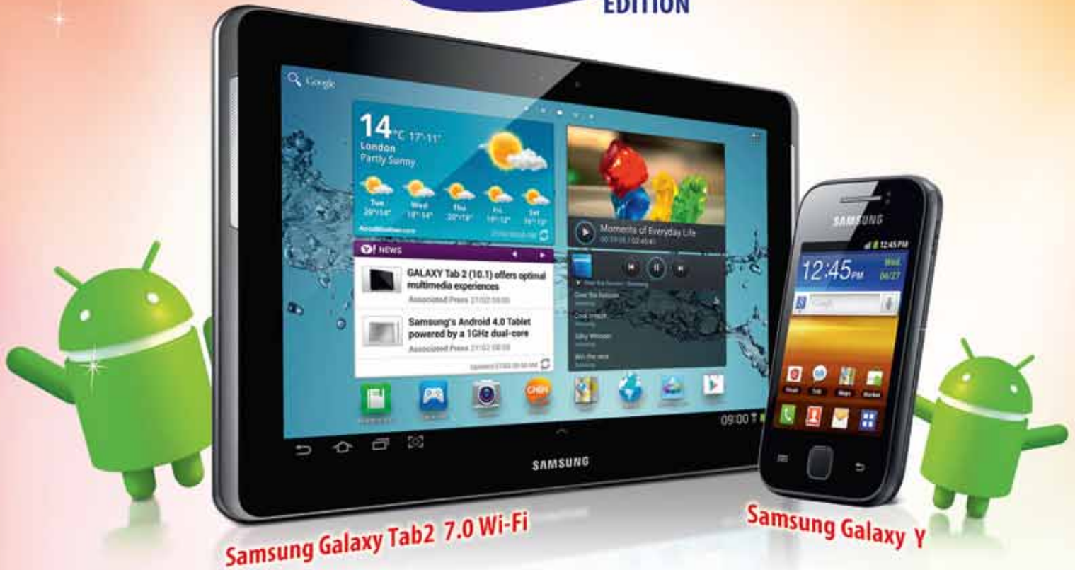
Samsung Galaxy Tab2 7.0 Wi-Fi