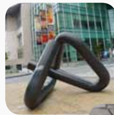
◀ Noguchi by Arturo Luz, Ayala Museum*