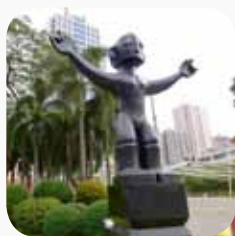
◀ Watching the Watchmen by Ronald Ventura, Glorietta 3 Park