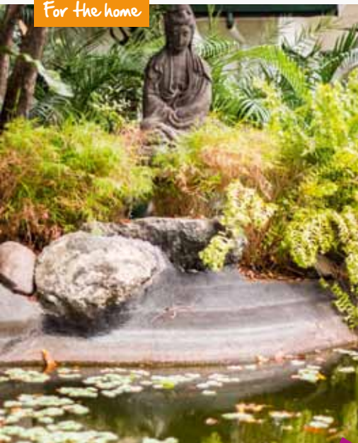
For the home

INDOOR PLANTS AND TREES It's almost like an oasis of greenery among all the high-rise developments in the Central Business District. They have many plants for sale. Available at The Makati Garden Club