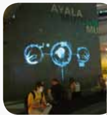
◀ Glass Feathers by Acid House, Ayala Museum

To complement the Art Fair, priceless pieces of urban art installations that delivered a multi-sensory experience were scattered in the city .