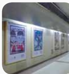
◀ Pedestrian Art Gallery, Legazpi & Sedeno Underpass