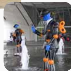
▶ Blue Men in Black Suits by Charlie Co, Tower One & Exchange Plaza Buiding