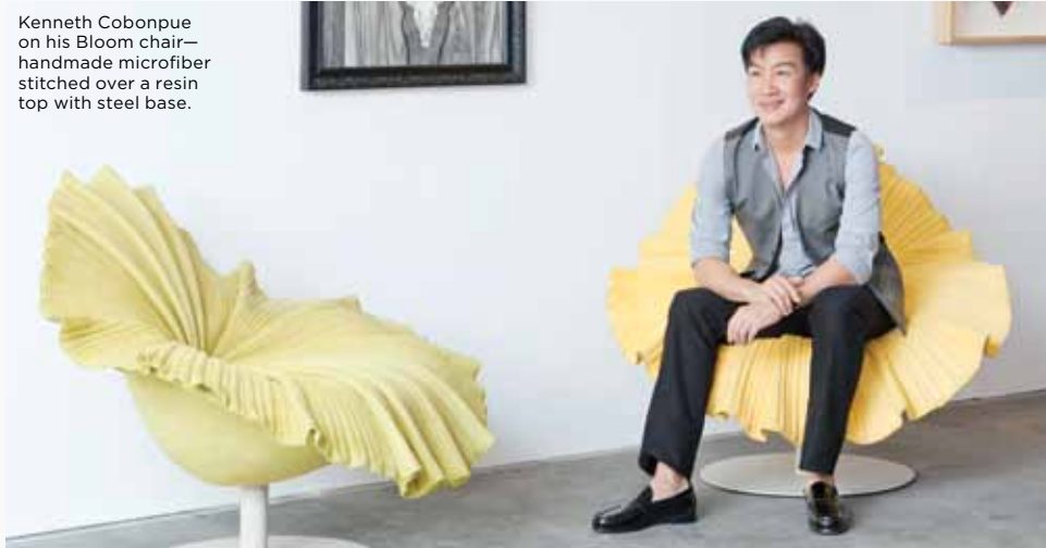
Kenneth Cobonpue on his Bloom chair—handmade microfiber stitched over a resin top with steel base.

Dubbed by "TIME Magazine" as 'rattan's first great virtuoso,' Kenneth Cobonpue has truly made his mark in furniture design, with his unique creations capturing the admiration not only of Filipinos but that of the international audience as well. A proud Cebuano, Kenneth is well-known for combining locally sourced materials with pioneering production processes that results in admirable works of art.