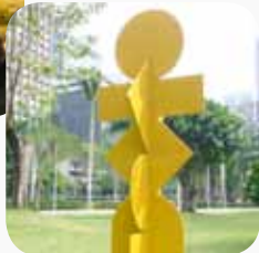
▶ Tribal Series #6 by Arturo Luz, Ayala Triangle Gardens*