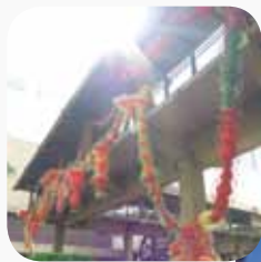
◀ Entropy by Leeroy New, Elevated Walkway, Makati Avenue